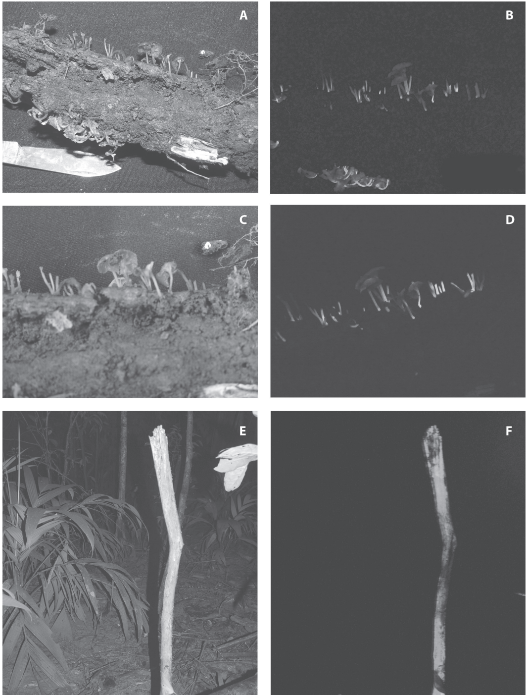
Fig. 2. A. Mycena s.l. 1 (photograph taken in daylight). B. Mycena s.l. 2 (photograph taken in the dark showing bioluminescence). C. Mycena s.l. 2 (photograph taken in daylight). D. Mycena s.l. 2 (photograph taken in the dark showing bioluminescence). E, F. Preferred substrate of the fungi found in this study, (photograph taken in daylight [E] and at night [F]).